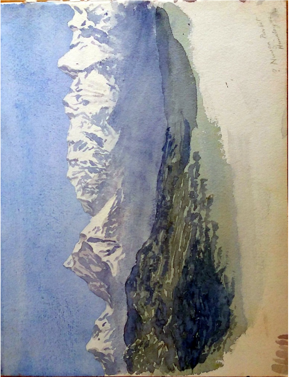
Plate 13 Nimji Purbit or Nunga Parbit?