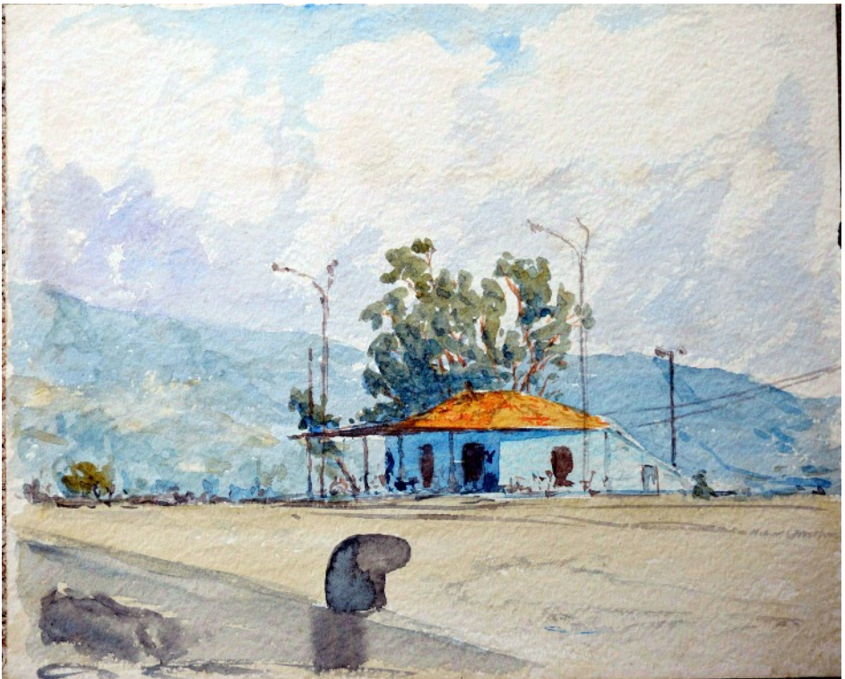
Plate 15b - Missalonghion? with the Blue Mountains.