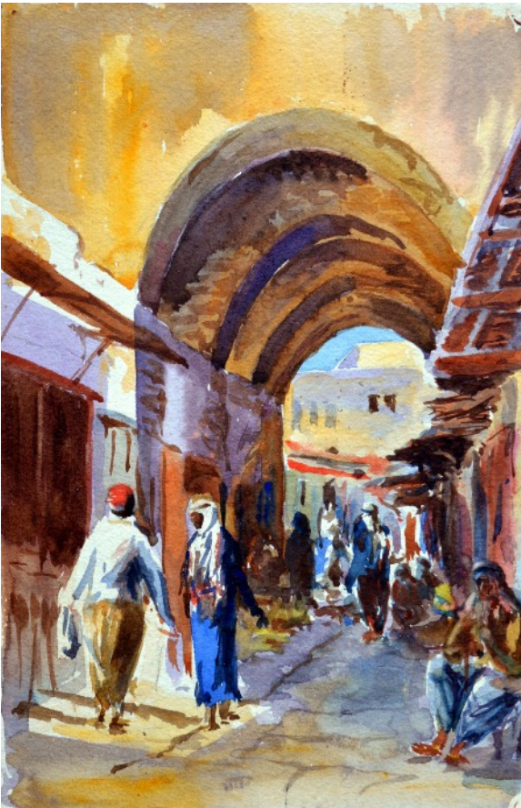
Plate 11b A narrow steet in Acre.