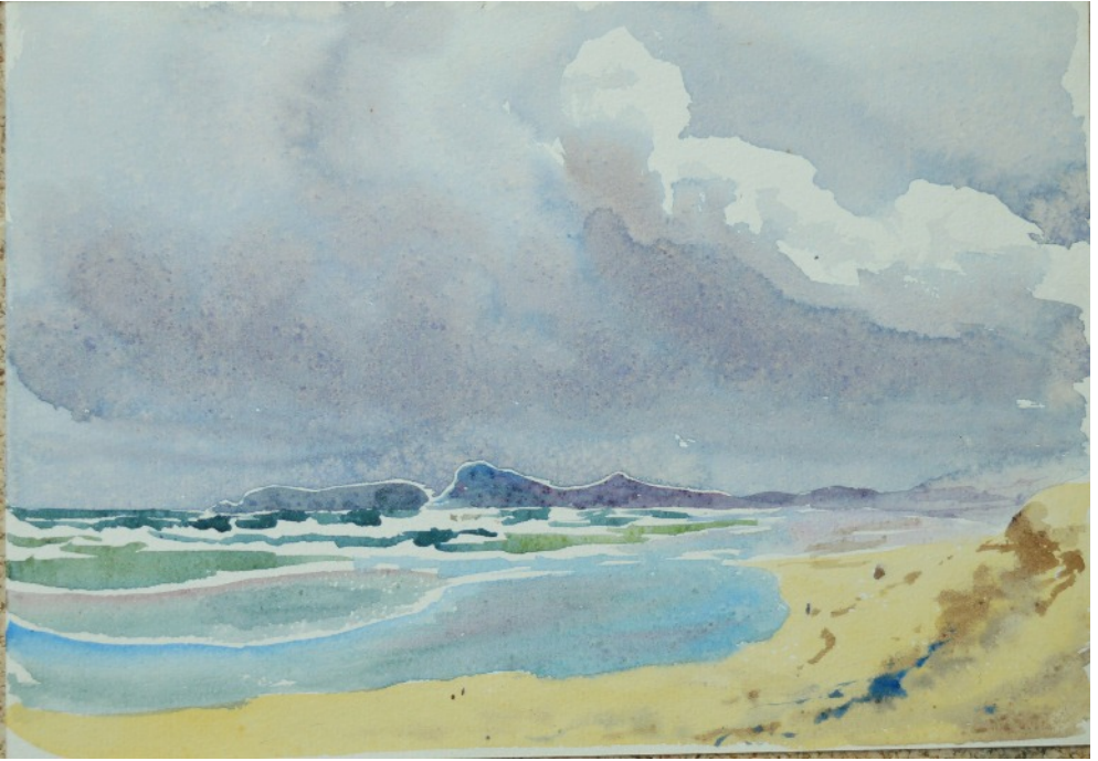
Plate 15a - Queensland coast.