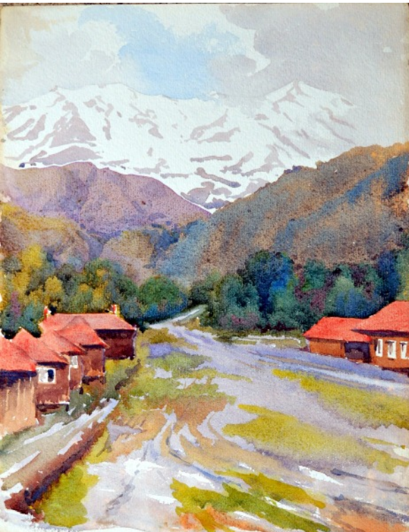
Plate 18 Scenes in New Zealand South Island.