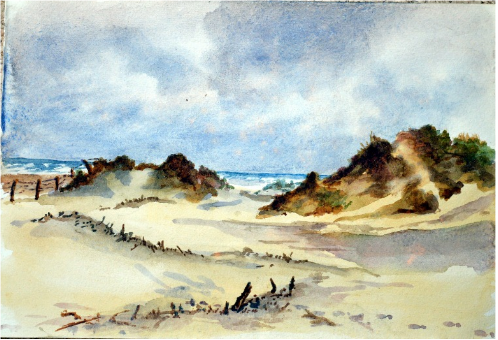
Plate 11a - near Acre.