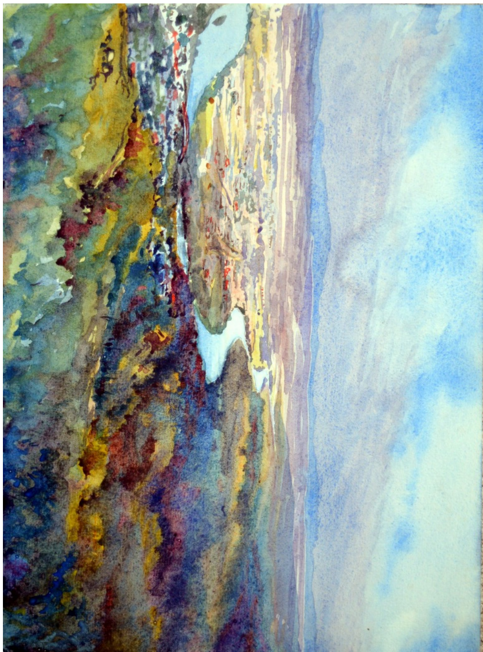
Plate 14 Brisbane from One Tree Hill.