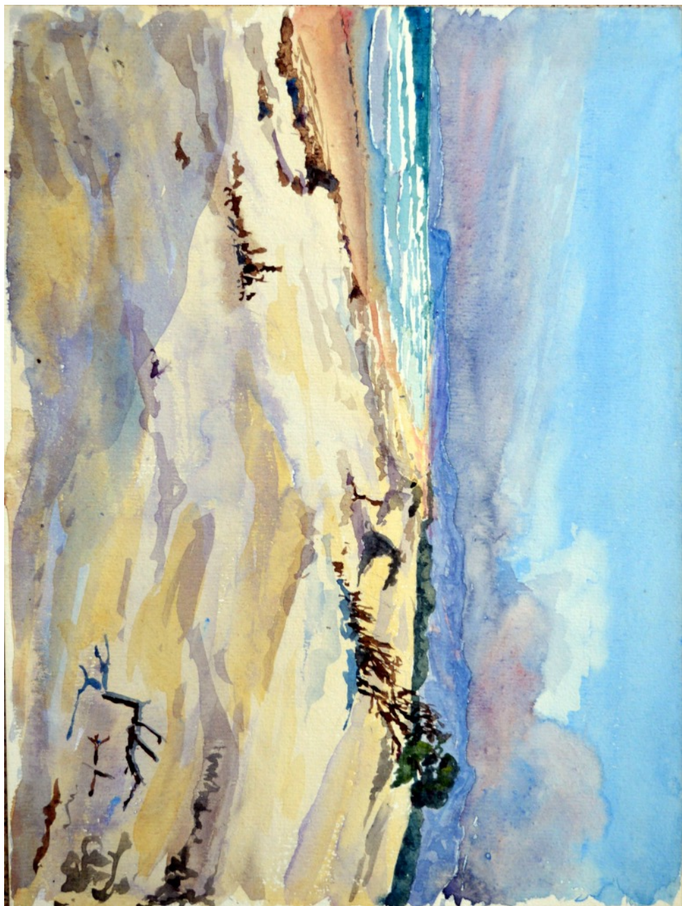
Plate 16 Queensland coast.