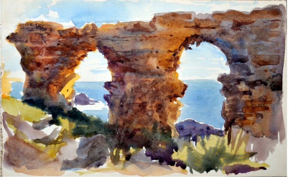
Plate 12a - Ruined walls of Athlete.