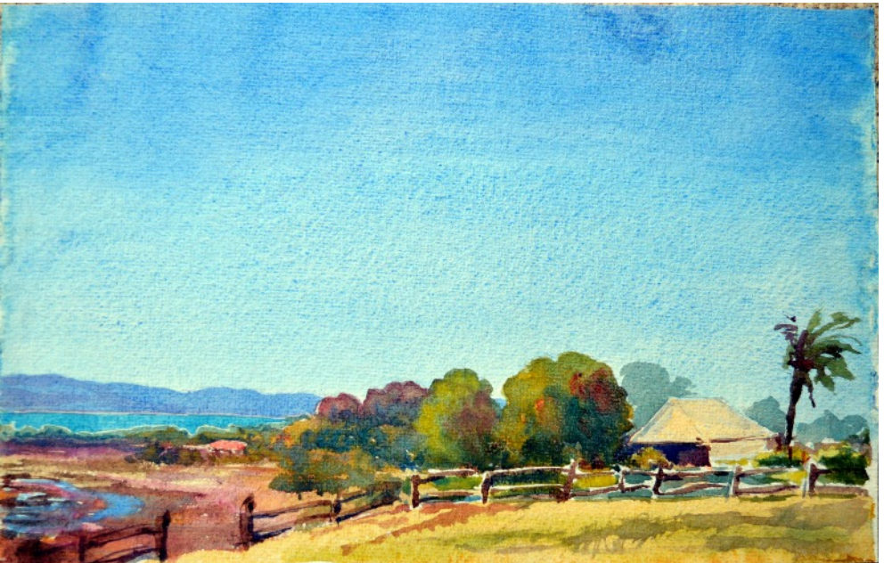
Plate 12b - Queensland.